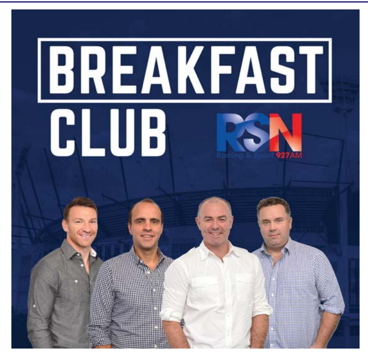
"The Breakfast Club - Monday to Friday - 6am to 8.30am"

Hear the VAFA William Buck Premier match of the day on RSN Carnival every Saturday. Kicking off with the For the Love of the Game podcast from 12pm, the live pre-game from 1pm and the first bounce at 2pm. Uninterrupted until 5pm.