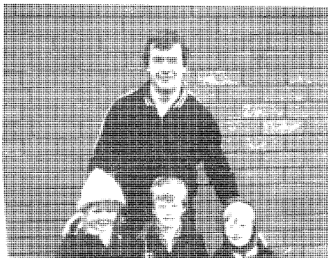
THE AMATEUR FOOTBALLER — 1985